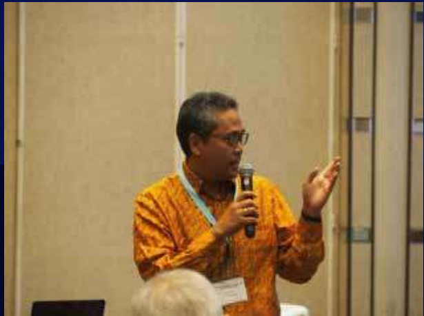
L-R: Key VIPs and Senior level speakers from Directorate General Oil and Gas, SKK Migas and PT Pertamina

With LNG and natural gas set to be at the forefront for the power sector in Indonesia, many stakeholders are beefing up their presence and influence in the highly potential market. LNG to Power integration projects below 200MW and Floating LNG Power Plant and Barges are among the key areas that will be highlighted during this forum. The projection to be a net LNG importer by 2022 – a inevitably move to support both power generation and industries – has mobilized state owned enterprises and the private sector to either tender out, procure or build LNG infrastructures and small FSRUs in West Papua and Eastern Indonesia region.