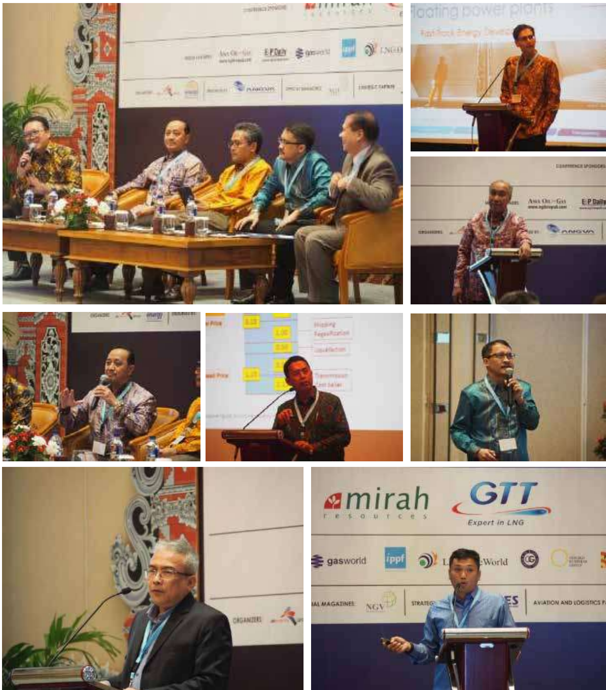
L-R: Stakeholders from BPH Migas, PT PLN, PT PGN LNG, GTT, PT Humpuss Intermoda Transportasi, PT PJB, PT Nusantara Regas & PT MedcoEnergi

Pelindo Energi Logistik's floating regasification unit (FRU) and floating storage unit (FSU) operating in Bali has paved the way for a real and realistic era of small-scale floating LNG regasification options for stakeholders – especially in other parts of Indonesia. This facility will cement continued interest for stakeholders wanting to distribute LNG in smaller parcels, as marine fuel and for other small-scale uses.