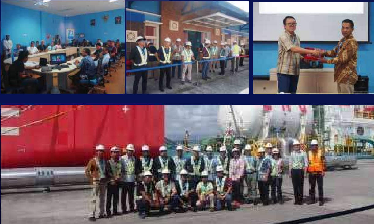
L-R: Participants attending the site tour at the Bena LNG Terminal

Key senior stakeholders that presented and attended this important event include the Directorate General of Oil & Gas, SKK Migas, BPH Migas, PT Pertamina, PT PLN, PT PGN, PT Nusantara Regas, PT PGN LNG, PT Pertagas Niaga, PT Indonesia Power, PT PJB, PT BKI, Oil And Gas Regulatory Authority - Government Of Pakistan (OGRA).